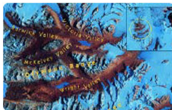
Example of the available satellite image maps of the Antarctica, especially McMurdo Sound region of the Transantarctic Mountains, produced mostly from Landsat thematic mapper and SPOT imagery.