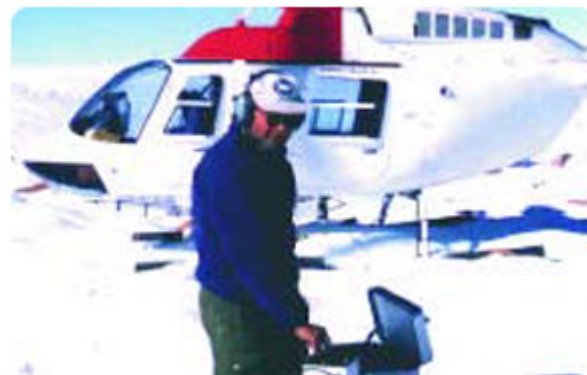
The USGS is improving the accuracy of the initial geodetic surveys by adjusting the earlier data to an Earth-centered geodetic satellite reference system.