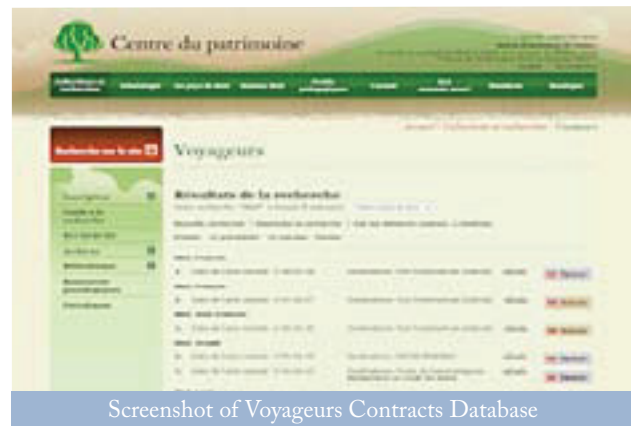
Screenshot of Voyageurs Contracts Database

Andornot is delighted to have been able to assist the Heritage Centre to improve access to these important sets of historical records. ☒