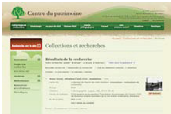
Screenshot showing search results in Societe historique de Saint-Boniface Archives database

"The Centre du patrimoine - Heritage Centre decided to do a completely new web site two years ago. Our goal was to have a user friendly website both for the general public doing research and for the staff updating the various sections of the site. One of the main objectives was to use as much as possible the Web 2.0 features in the limits permitted by our budget and staff resources. We wanted to have those features integrated into the database search and results interfaces as much as possible," says Gilles Lesage, Directeur général of the Heritage Centre.