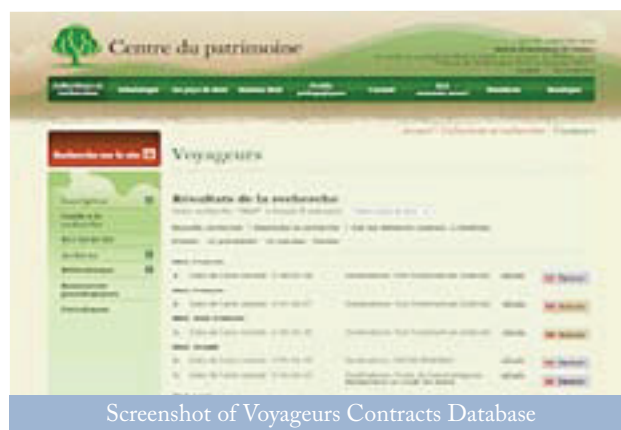
Screenshot of Voyageurs Contracts Database

Andornot is delighted to have been able to assist the Heritage Centre to improve access to these important sets of historical records. ☒