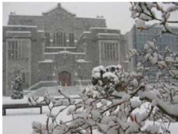
SLAIS and the Irving K. Barber Learning Centre in the snow.

Keep up with news of the event, including weekly tweets of past gems uttered by SLAIS faculty, by following us on twitter ( @slais50 ). And don't miss out on the 50th Anniversary's Virtual Memory Wall – visit http://slaismemorywall.wordpress.com/ for a trip down memory lane, and be sure to make your own contribution of a memory, a photo, or a shoutout to friends and classmates.☒