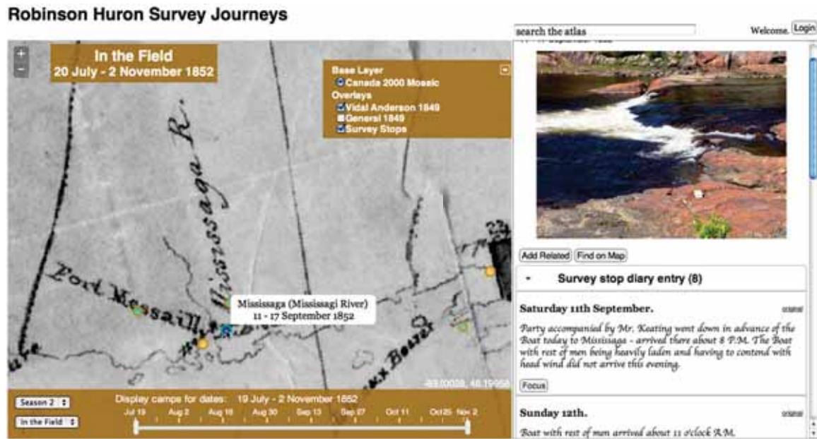
Figure 3. Cybercartographic Atlas of the Lake Huron Treaty Relationship Process.

original record is provided, it becomes less important as the atlases allow for the re-interpretation of original records.