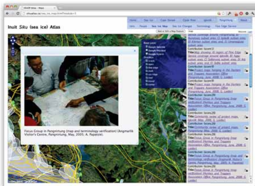
Figure 1. The Inuit Siku (sea ice) Atlas.

The Kitikmeot Heritage Society, Inuit Heritage Trust's Traditional Name Placing Project and the Gwich'in Cultural Society among others have approached the GCRC to help them map their place name databases with their collections of audio recordings of place names and video recordings of elders narrating the stories of those places. These place name atlases 42 have become important knowledge transmission tools from elder to youth, are cultural geo-linguistic heritage preservation tools, have been incorporated as part of school curricula and are land occupancy records depicting the territorial extent of a community's land use and settlement. Naming places is part of the infrastructure of experience 43 and represents social relationships, kinship, historical events and shared cultural memories. These atlases are enabling local communities to replace their histories onto the map and others to see space from a different cultural lens.