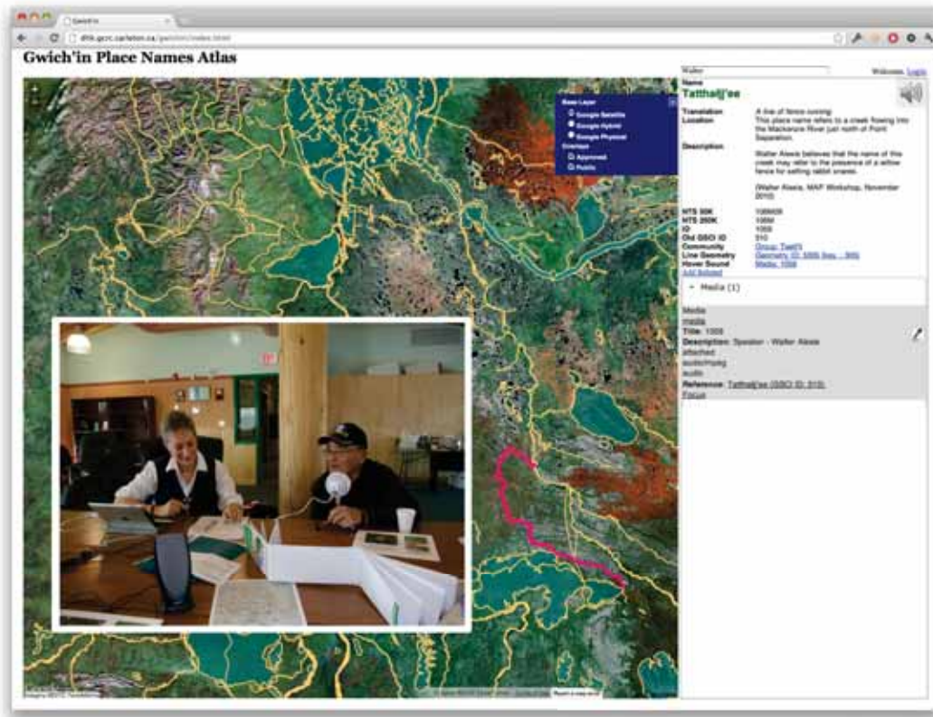
Figure 2. Gwichin Place Name Atlas.

aggregated into a database. This database of stories is then mapped onto old and new maps along with georeferenced photographs, historical maps, signed treaties and the historical and archival records surrounding them. In addition, some historical maps were geo-rectified according to contemporary map projections 46 and layered with the oral history of events accounted by community elders or with the geo-transcribed stories from surveyor and explorer notes. These participatory and counter cartographies are enacting a post colonial mapping of Canada's treaty system. These atlases are therefore 'remapping' the official historical record by reflexively using western geospatial technologies, multimedia and methods in such a way so as not to recolonize. 47 Furthermore, they are also providing geonarratives to the making of colonial maps, making new records from old oral traditions, and by doing so put into question the 'authenticity' and 'completeness' of the traditional archival treaty record. Also, by geo-transcribing historical records, digitizing oral cultures, and re-purposing old maps in new ways, cybercartographic atlases are giving each of these records a 'secondary provenance', 48 even though the provenance of the