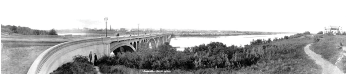
Newly completed University Bridge; South Saskatchewan River in background, University of Saskatchewan President's Residence at far right.

Cover image: Traffic (Victoria) Bridge, ca. 1925. This bridge, completed in 1907, made the formation of the city of Saskatoon possible. Nutana joined the two west side communities of Riversdale and Saskatoon in applying for a city charter on the condition that a traffic bridge would be built to join the two sides of the river, previously only joined by ferry.